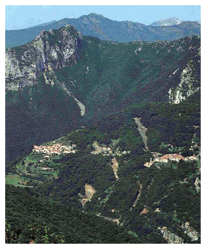
Fig. 3. Front view of NE sector of River Vezza basin. Debris flows/slides developed along slopes are clearly visible. The villages of Pruno (right side) and Volegno (left side) were partially affected or menaced by landslides.

The analysis of the 19 June 1996 disaster as well as historical occurrences of landslides, emphasizes that heavy rainfall promotes a generalised instability of the Vezza basin. This area is highly susceptible to superficial landsliding that involves mainly the soil cover of slopes. Such condition suggests the necessity to undertake a spatial analysis for landslide hazard assessment of the area using the potentiality of a GIS. The adoption of a GIS actually allows the analysis,