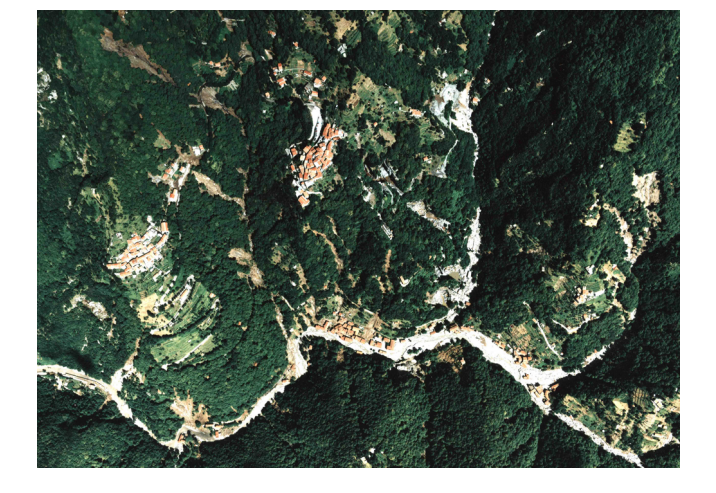
Fig. 2. Aerial photo of NE sector of River Vezza basin. This portion of the basin (approx. 2.5 \text{ km}^2 ) evidenced the highest landslide density (> 20 landslide/km<sup>2</sup> and 10% of the area affected) and damage caused by the rainstorm of 19 June 1996. The village of Cardoso, sited in the confluence of two torrents, is visible on the right bottom of the photo; The territories of Pruno (right side) and Volegno (center) have been heavily affected by landsliding.

landslides (mostly debris flows) were triggered along the slopes (Figs. 2 and 3).